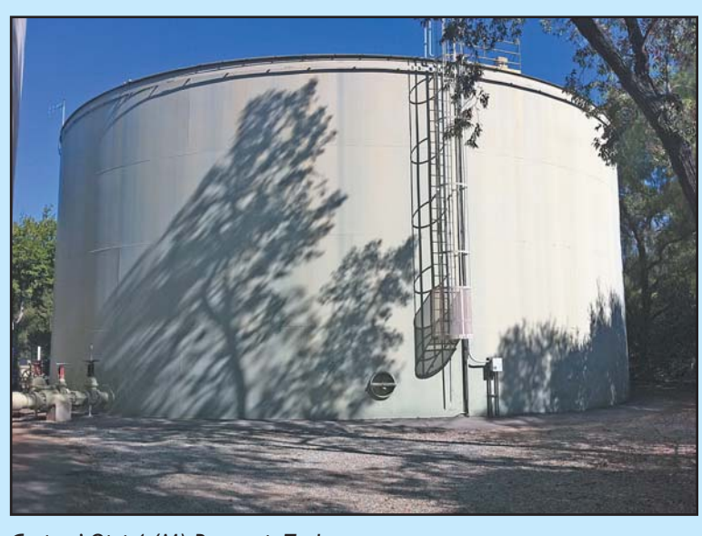
Casitas' Ojai 4 (M) Reservoir Tank.

maintaining the treatment plant and storage reservoirs. This year's projects include repairing and coating the interior of one of eight filter vessels at the treatment plant and coating two steel reservoirs. Repairs on the filter vessel at the treatment plant involve removing the filter media, repairing the vessel structure, applying a long-term coating and re-installing the cleaned filter media. Casitas organized repairs on 8 filter tanks over a period of 6 years so that water rates would not